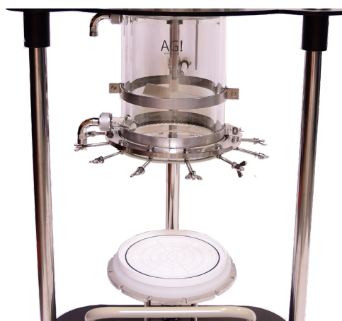
MOBILE CART FOR EASY CAKE REMOVAL