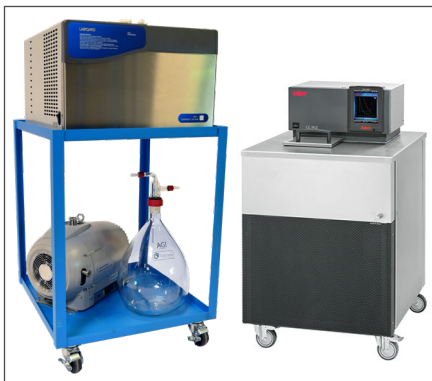
MOBILE CART WITH COLD TRAP, VACUUM PUMP, CARBOY, AND TEMP CONTROL