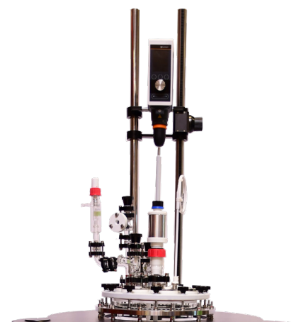
HEIDOLPH OVERHEAD STIRRER ON HEIGHT ADJUSTABLE FRAME