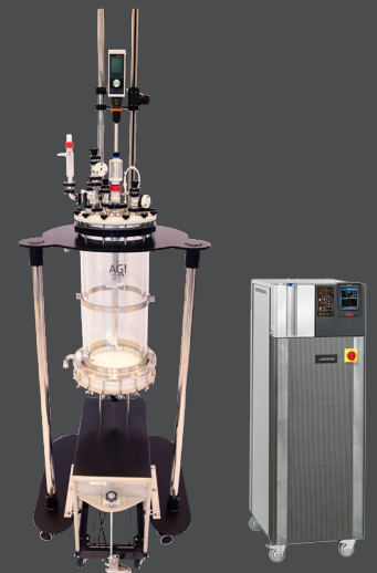
Winterize & Filter Crude 50L Filter Reactor with Huber Unistat 815

503-847-9047 sales@cascaDESCIENCES.com cascaDESCIENCES.com