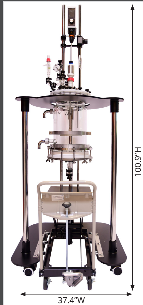
20L FILTER REACTOR